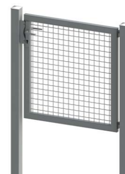
Wave grid 50/50/5 mm