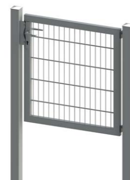
Flat bar panel Mesh size 50/200 mm