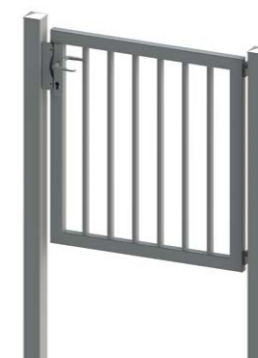
Rectangular tubes 30/20 mm