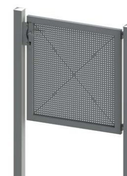
Perforated sheet - cross folded Holes 8 mm square