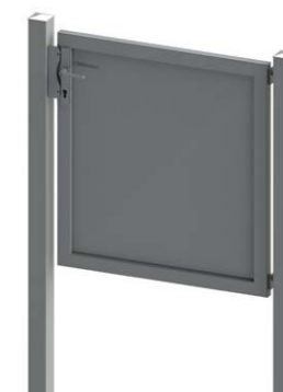
Metal plate - cross folded