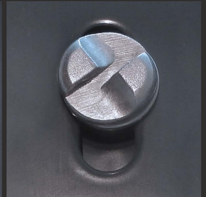
One-way security screw