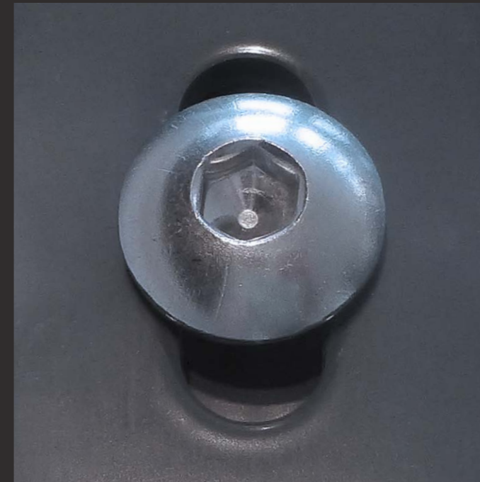
Hexagon socket screw (Allen screw)

By using our modern tube laser system, we can offer you exceptional solutions for any demand you may have. Please contact us!